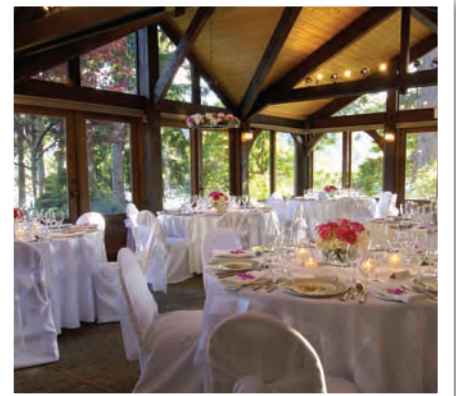
Above: The Verandah at Hastings House (Hastings House Country House Hotel)

The charming and wild Southern Gulf Islands are a group of small islands just off the coast of south-eastern Vancouver Island near Victoria, B.C. Blessed with a Mediterranean-style climate, rural landscape and a wealth of wildlife, these islands