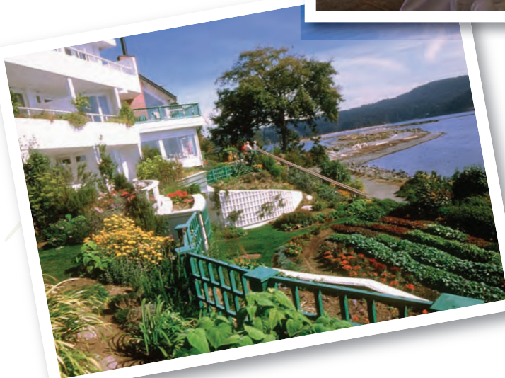
Left: Sooke Harbour House overlooks Whiffen Spit (Andrei Fedorov)